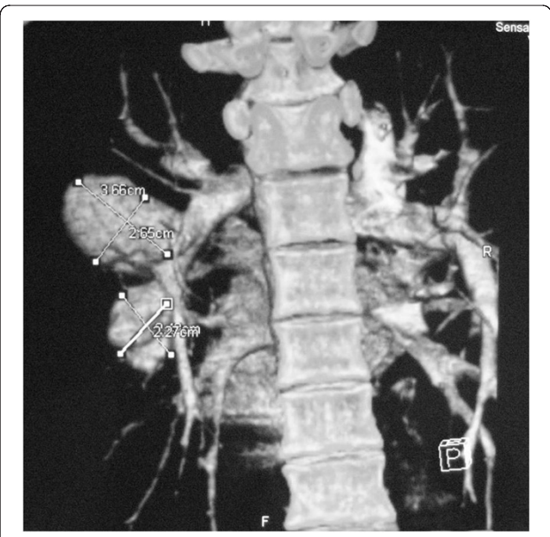
Figure 3 The thoracic MRI is showing the well-shaped, round hilar opacities on left hemithorax.

thrombosis. The aim of this report has been to demonstrate the effectiveness of immunosuppressive treatment on in situ thrombosis with PAA in a patient with BD. Contrast-enhanced thorax CT revealed the in situ thrombosis on the wall of PAAs. After the immunosuppressive treatment the in situ thrombosis was completely resolved and PAAs were reduced.