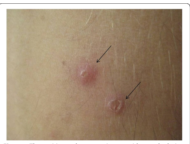
Figure 4 The positive pathergy test is seen with pustular lesion on injection area of body (black arrows).

In conclusion, inflammation in pulmonary arteries is causing in situ thrombosis and it contributes to the development of PAAs in patients with BD. The anti-inflammatory and immunosuppressive drugs are essential for the treatment of in situ thrombosis and PAAs in patients with BD.