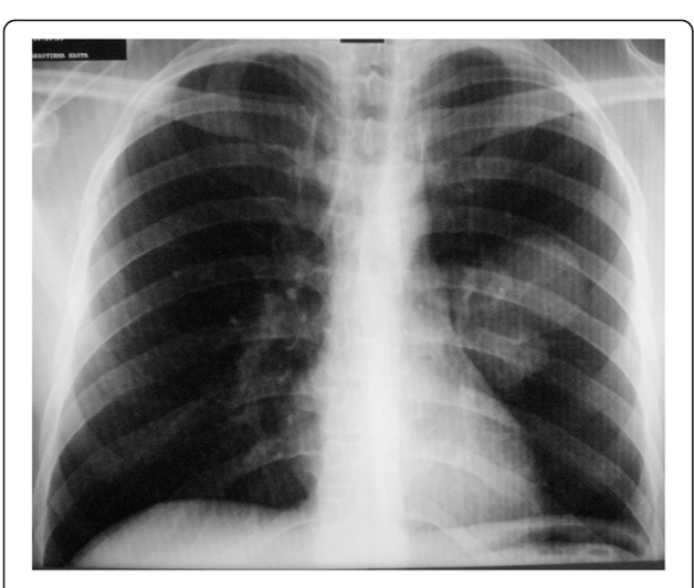
Figure 1 Chest radiography is showing the well-shaped, round hilar opacities on left hemithorax.

media and dilatation of the vessel lumen. Thickening of the vessel wall is caused by inflammation and infiltration by lymphocytes, plasma cells and neutrophils. Thrombosis of the pulmonary arteries in BD is usually an in situ thrombosis [2,8]. Because the main problem is the inflammation of pulmonary arteries, the main stay of treatment should be the anti-inflammatory and immunosuppressive agents in patients with PAA and BD. A combination of cyclophosphamide and methylprednisolone is used most frequently in patients with PAA [9]. We know that anticoagulant therapy could increase the risk of aneurysmal rupture and anticoagulant drugs might be unnecessary in BD [5]. Mehta et al. reported a case with in situ thrombosis with BD [10]. They reported the patient had remained clinically stable with no further episodes of hemoptysis with immunosuppressive treatment including dexamethasone and cyclophosphamide [10]. However, there was no radiologically demonstrated efficacy of immunosuppressive treatment on in situ